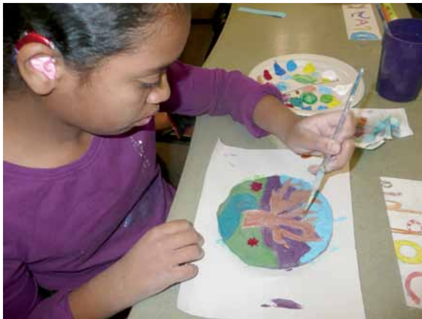
Student creating a landscape in clay from our 2019 – 2020 ARTworks Outreach program.