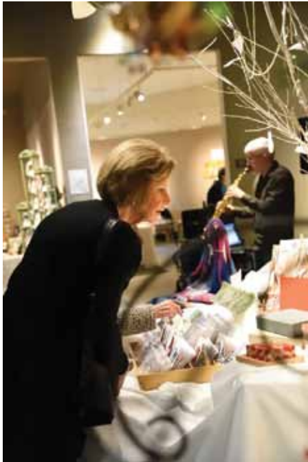
Beaux Cadeaux 2019